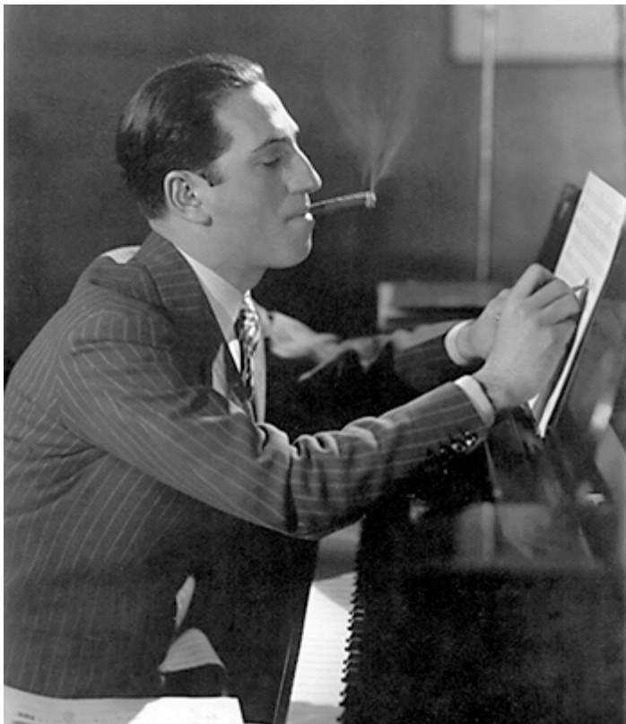
George Gershwin at work in the 1920s, around the time the Piano Concerto was written.

Due to contractual obligations for three different Broadway musicals, Gershwin was not able to start work until May 1925. He began the two-piano score in July, after returning from a trip to London, and the original drafts were entitled New York Concerto . The first movement was written in July, the second in August, and the third in September. Gershwin booked practice facilities at the Chautauqua Institution which offered seclusion for Gershwin to focus on the task in hand. Gershwin was able to complete the full orchestration of the concerto on 10 th November 1925.