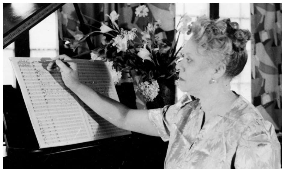
Florence Price photographed at work in the 1940s.

'The opening movement has melodies and rhythms typically found in Afro-American folk music, and recalls Dvořák's New World Symphony, while the following slow movement features a moving hymn tune of Price's design. Both concluding movements are fast and return to the juba dance concept. They contain hints of fiddles and banjos, antic slide whistle effects, and a recurring three-against-two melody which end this loveable work on a whimsical note.'